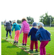
OST Best Practice Series