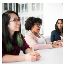
Management Training Series